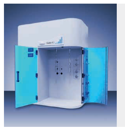
iSorb HP series

High-pressure, high-precision volumetric gas sorption analyzer