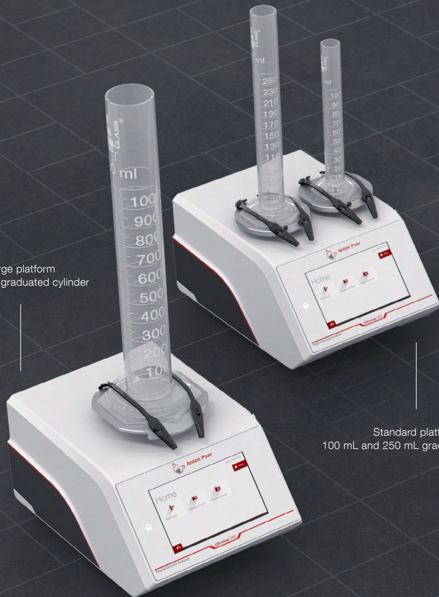
Standard platform 100 mL and 250 mL graduated cylinder