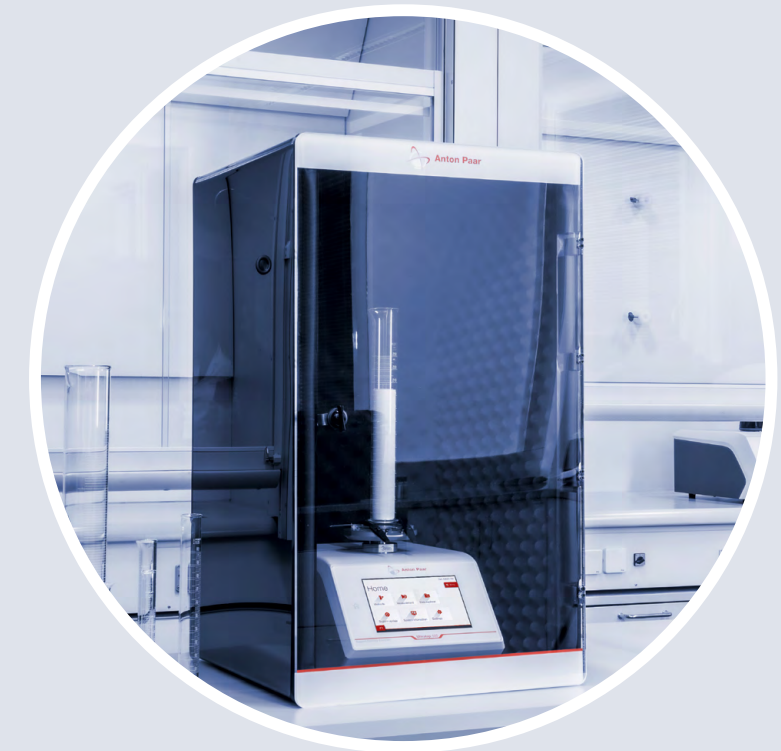
↑ NOISE REDUCTION CABINET