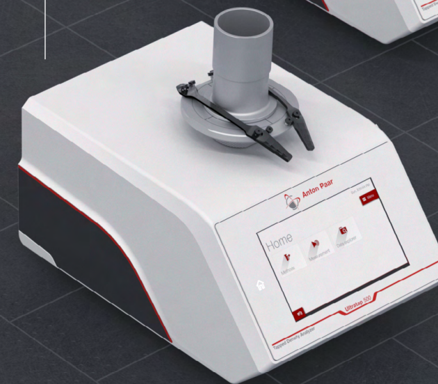
Small platform 10 mL graduated cylinder