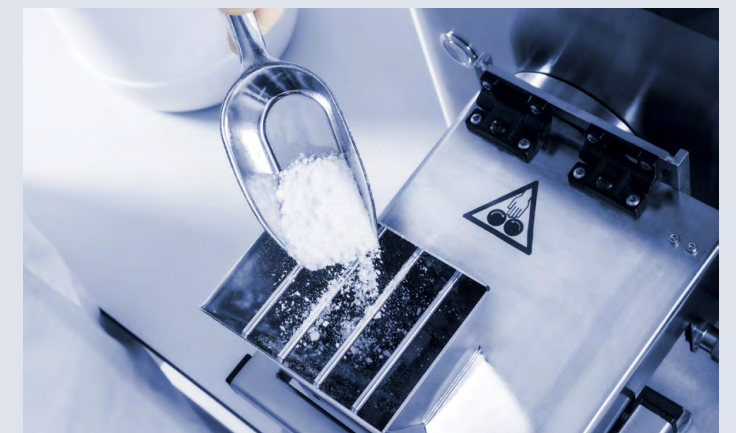
Mixer for characterization of silica and other powdery materials