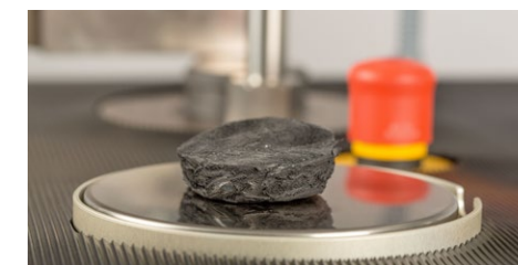
Integrated sample balance with automatic measured value transfer