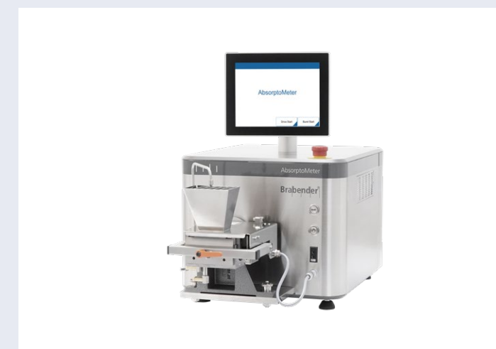
Unique on the market: Mixer for characterization of silica and other powdery materials