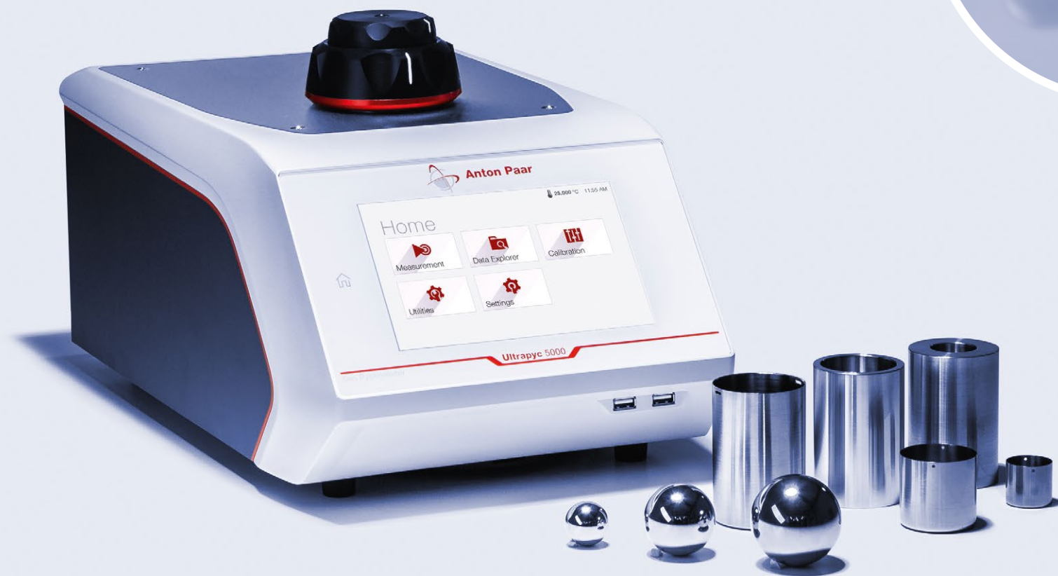
← DISPOSABLE CUPS

SOFTWARE FOR YOUR PAPERLESS LAB: AP CONNECT