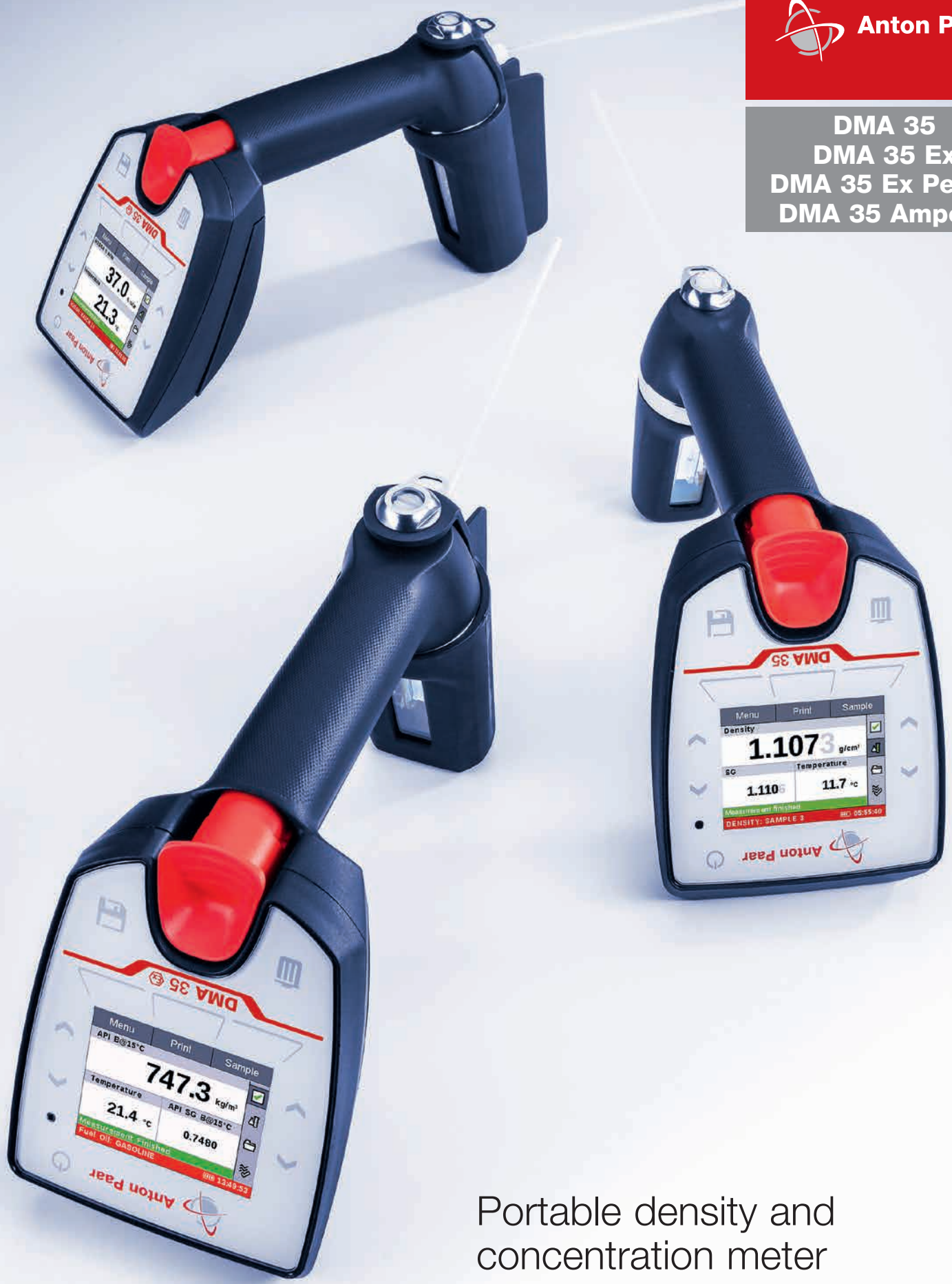
Portable density and concentration meter

DMA 35 DMA 35 Ex DMA 35 Ex Petrol DMA 35 Ampere