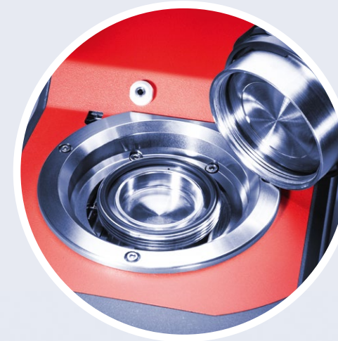
↑ RapidOxy 100

With their high temperature range of up to 180 °C and tight temperature control, RapidOxy 100 and RapidOxy 100 Fuel deliver results in a fraction of the time compared to other accelerated aging methods. The only manual step of the measurement is filling in the sample – leaving no room for errors. Add to this accurately monitored pressure in the closed system throughout the measurement, and the outcome is highly precise test results.